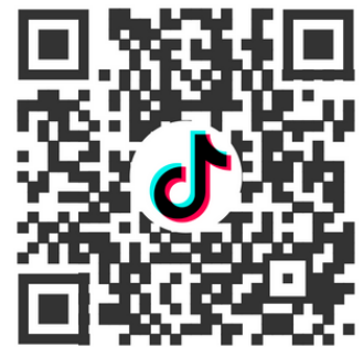
DOUYIN (CHINESE TIKTOK)