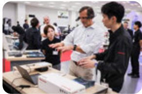
TECHNICAL SUPPORT TEAM

SEE YOU AT THE NEXT HORIZON SMART FACTORY!