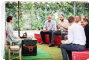
MATCHA TEA CEREMONY