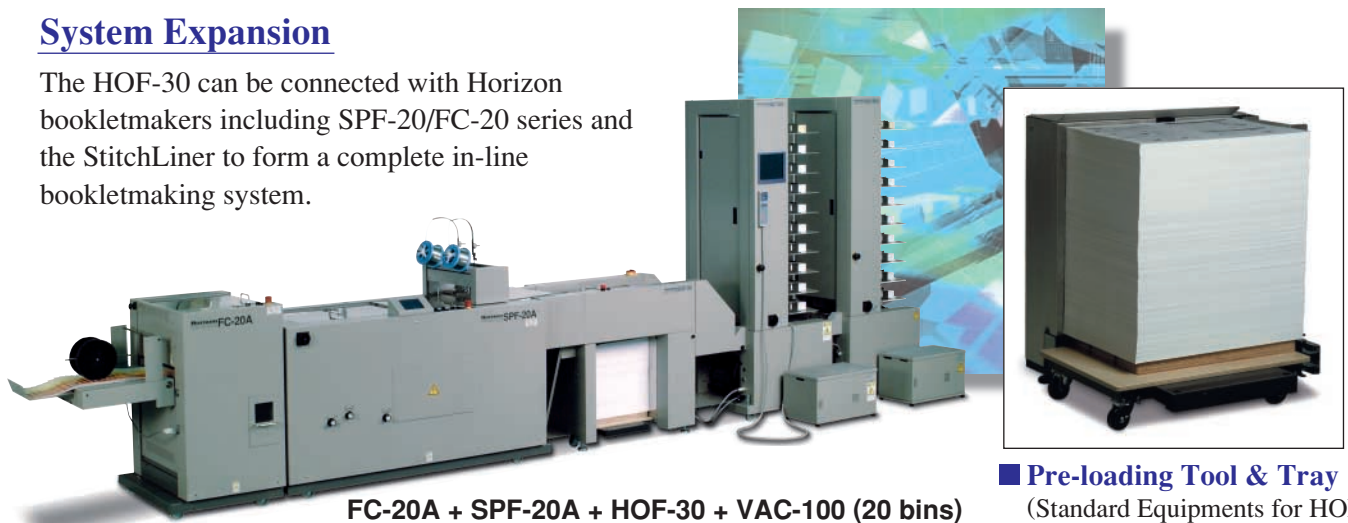
FC-20A + SPF-20A + HOF-30 + VAC-100 (20 bins)

The HOF-30 can be connected with Horizon bookletmakers including SPF-20/FC-20 series and the StitchLiner to form a complete in-line bookletmaking system.