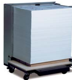
◀ PRE-LOADING TOOL & TRAY (Standard Equipment for HOF-20)