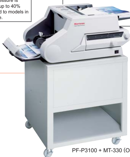
PF-P3100 + MT-330 (Option)

In the high-speed mode, the folding speed is increased by 40% over models in this range.