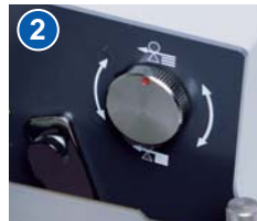
Feed Pressure Adjustment