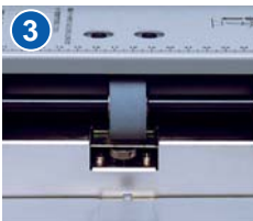
Pad Gap Adjustment