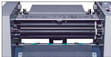
Photo : Fold buckle being removed.

Jammed sheet removal or roller cleaning can be performed easily, without any special tools.