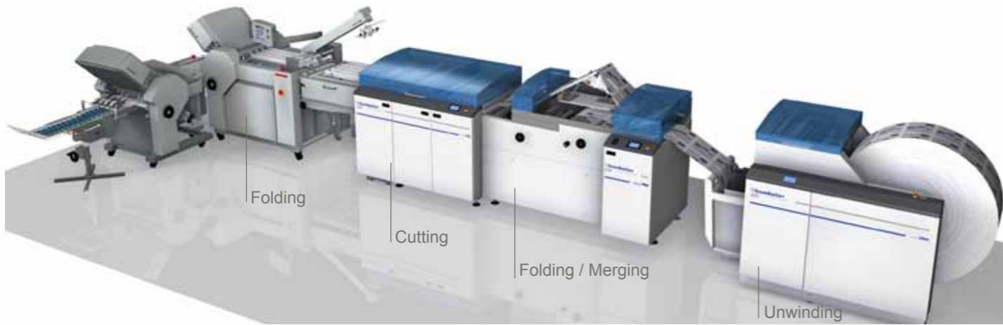
AF-566F Digital (Right angle 6+4 buckles) + Hunkeler sheet processing system

Easy operation and advanced technology increase the possibility of in-line finishing with surprisingly simple changeovers and application flexibility.