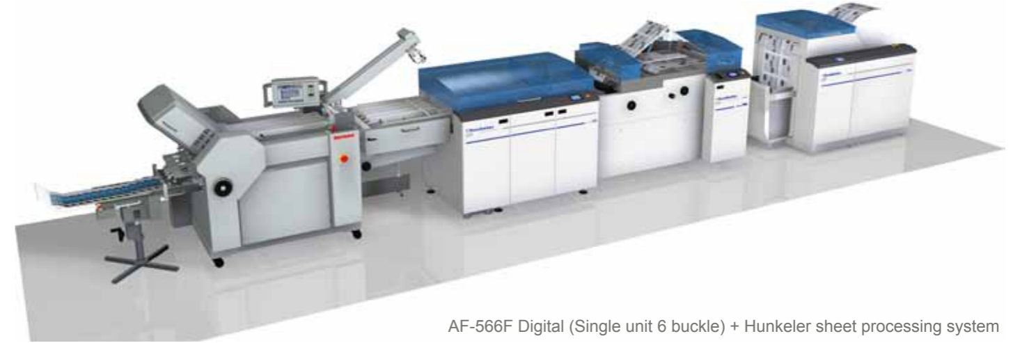
AF-566F Digital (Single unit 6 buckle) + Hunkeler sheet processing system