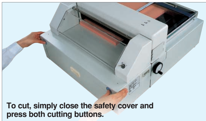
To cut, simply close the safety cover and press both cutting buttons.