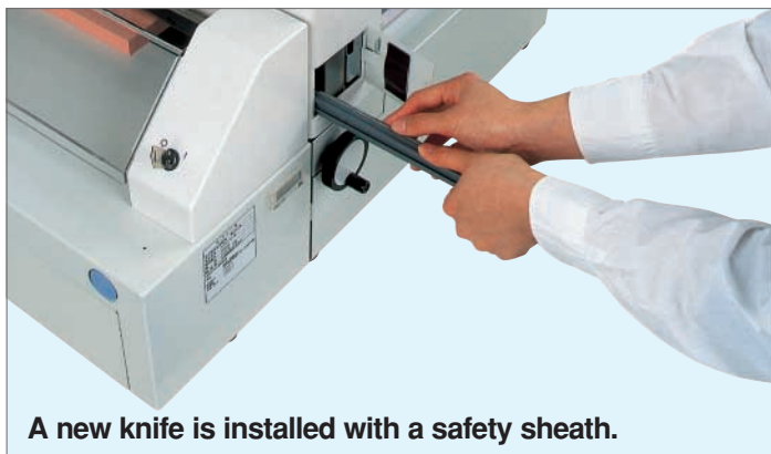
A new knife is installed with a safety sheath.