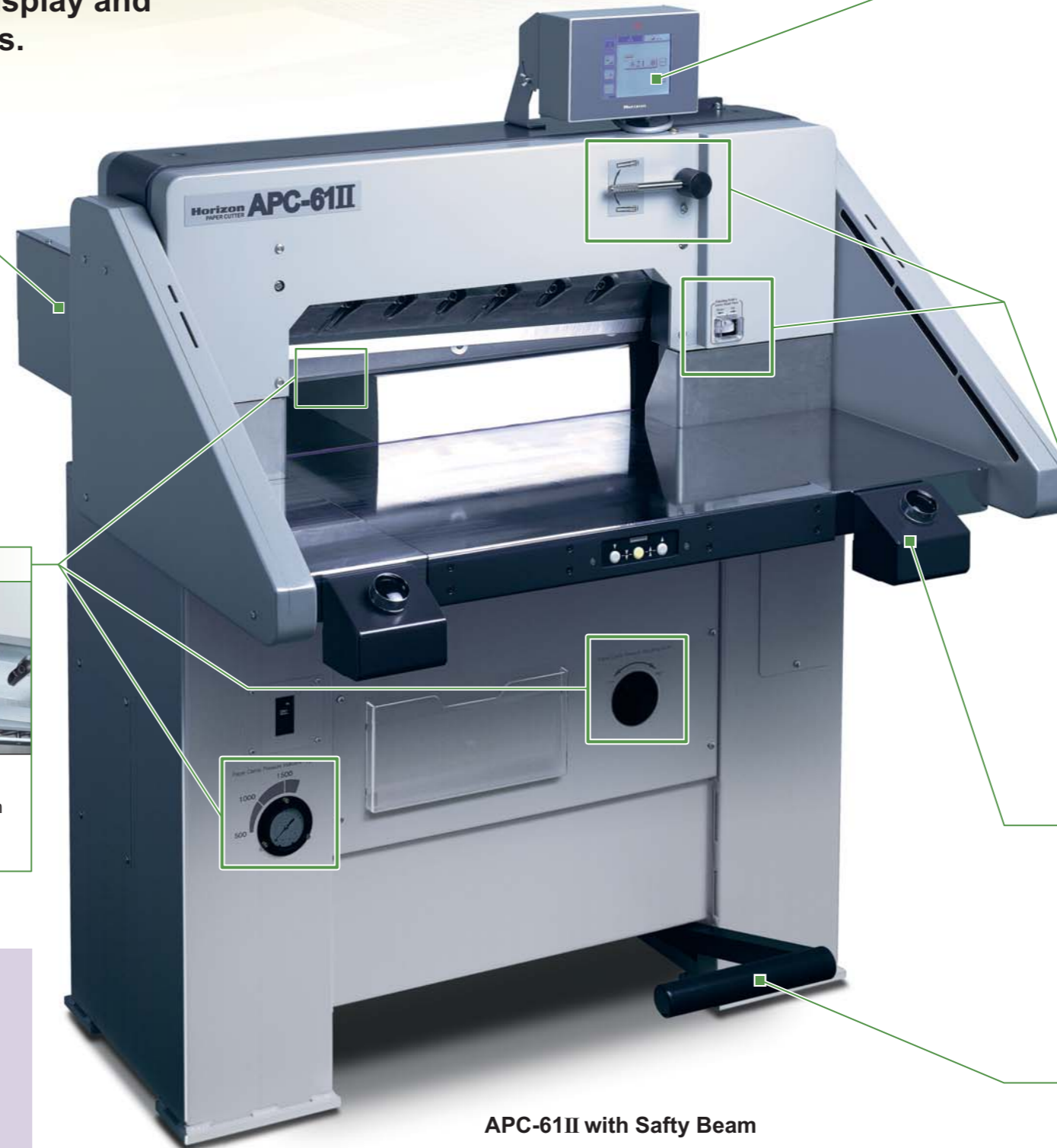
APC-61II with Safty Beam