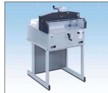
PC-45 Paper Cutter Cutting Width 44.6 cm (17.5")