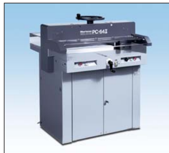
PC-64II Paper Cutter Cutting Width 64 cm (25.1")