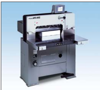
APC-61II Programmable Hydraulic Cutter Cutting Width 61 cm (24.0")