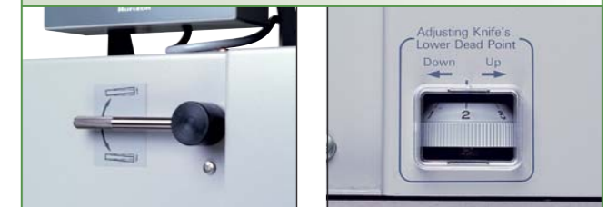
Knife Angle Adjusting Lever Cutting Depth Adjusting Dial