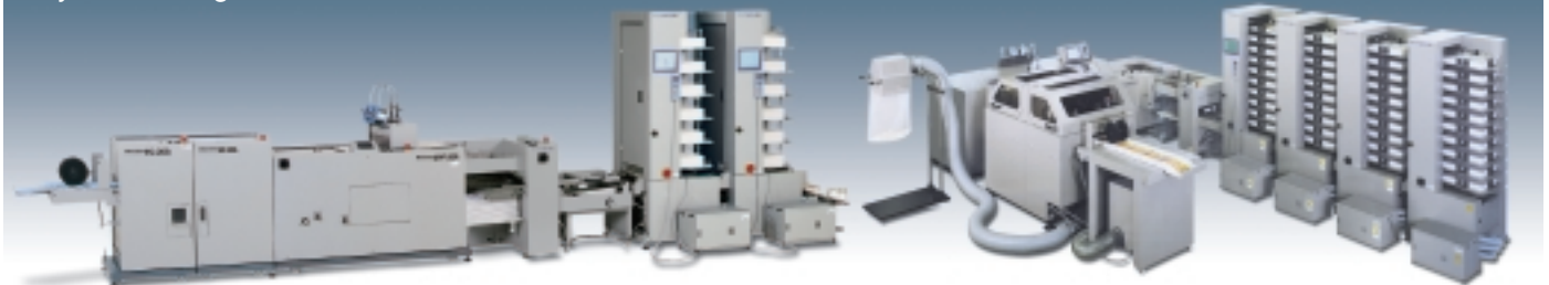
Bookletmaking System : FC-20A+HP-20A+SPF-20A+ST-40+SA-40+VAC60Ha+VAC-60Hc+PJ-77R