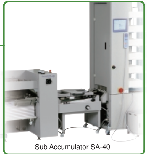
Sub Accumulator SA-40